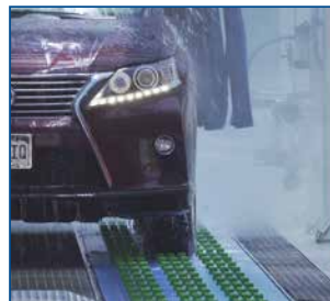
Conveyor belts available in 30in, 36in, 60in and 144in widths

FlowLine™ Belt Conveyor offers the best belt loading experience on the market. FlowLine™ is second-to-none in belt reliability and lowest total cost of ownership due to its superior design and construction.