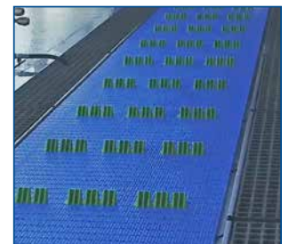
Car pushers spaced at 18in