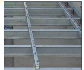
FlowLine™ Conveyors are available in Standard Duty (SD), Heavy Duty (HD) and Extreme Duty (XD) configurations