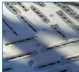
ExTrac™ dirt extraction system